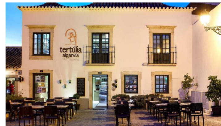
Tertúlia Algarvia Praça Afonso III, 13-15, Faro