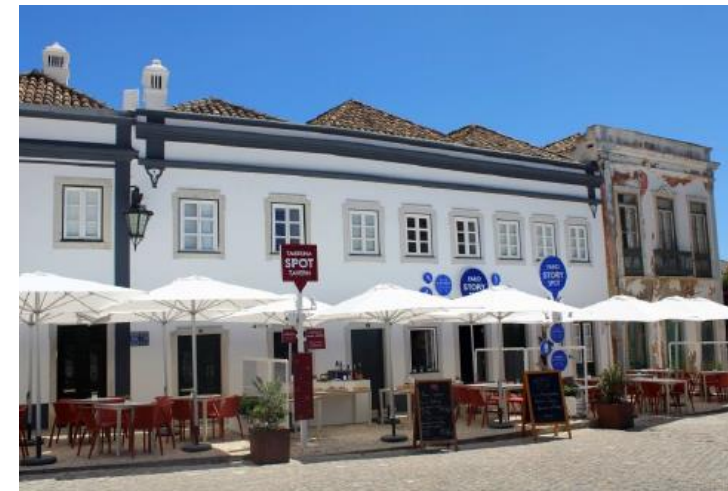
Faro Story Spot Largo da Sé, Faro